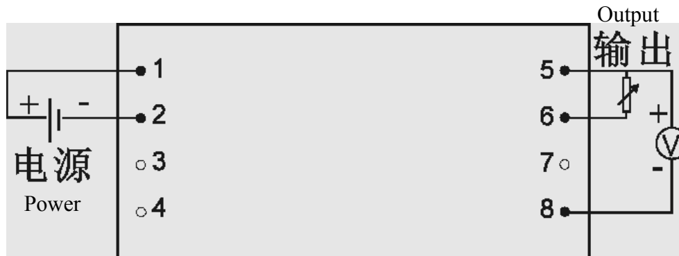
GRBxxxxD-xW-B B Model Connection Diagram (bottom view)